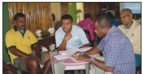
Participants in a group discussion at Korovou.

A community submission outlining the needs and concerns shared by participants, will be sent to the Ministry of Finance.