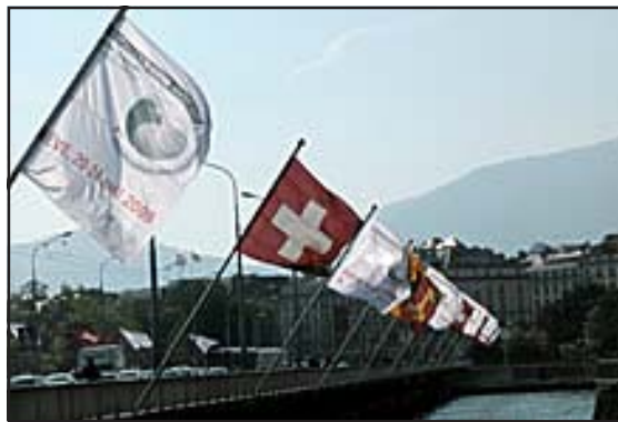
Durban Review Conference flags flying on the Mont Blanc Bridge in Geneva.